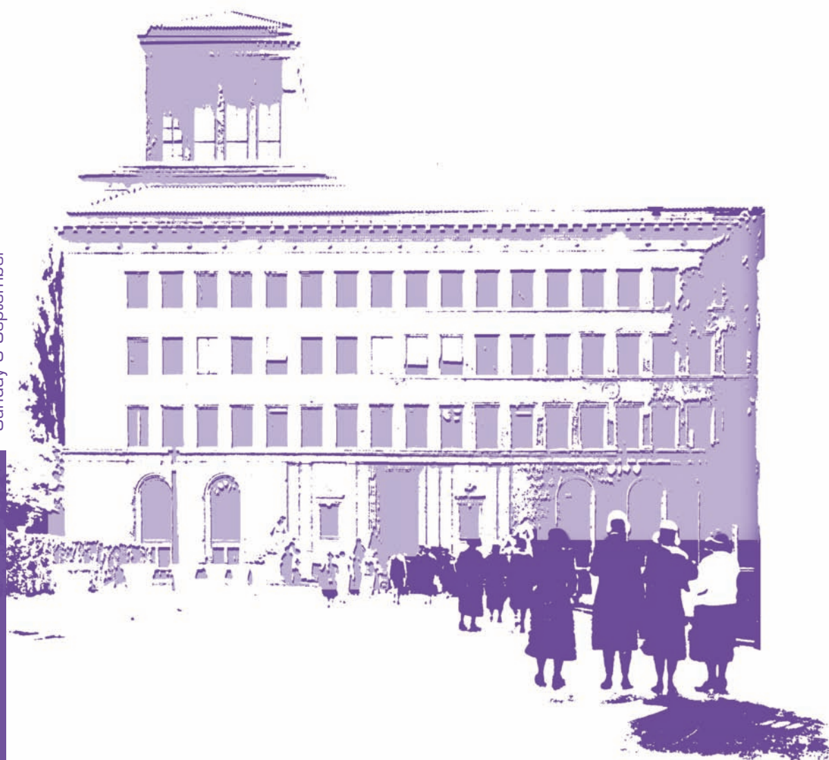
World Trade Organization, rue de Lausanne 154, CH-1211 Geneva 21, Switzerland (facing the Botanical Gardens)