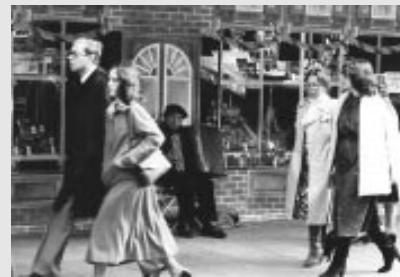
EU consumers are benefitting from more competition through lower prices for financial services, including insurance. (ILO)

The liberalization of financial services in the European Union (E.U.) has been part of the E.U.'s broader strategy to create a single market for goods, services, labour and capital. First efforts to create a single European financial market date back to the 1970s. At that time, some countries already removed their restrictions on capital movements. In the late 1980s, the creation of a single market was put at the top of the policy agenda of the then European Community. Meanwhile, a series of directives has completed liberalization of trade in banking, insurance and investment services. Liberalization in the E.U. is based on three fundamental principals: first, minimum harmonization of standards at the E.U. level; second, mutual recognition of national laws and regulations between E.U. Member States; and third, supervision of companies in their (E.U.) country of registration (home country control). The regulatory framework has been completed by the entry into force of the Second Banking Directive in 1993, the Third Life and Non-Life Insurance Directives in 1994, and the Investment Services Directive in 1996. These directives are complemented by a series of other directives defining key concepts and establishing essential prudential requirements. This framework grants E.U. companies and incorporated foreign subsidiaries in the E.U. the right of operation in all E.U. countries when they are registered in just one ("Single Passport").