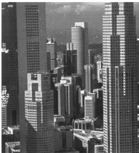
Singapore's banking district: an open and well-regulated financial services sector in tandem with macroeconomic stability have promoted growth.

Liberalization of financial services can have strong positive effects on income and growth. Developed and developing countries with open financial sectors have typically grown faster than those with closed regimes. The economic success of Hong Kong (China) and Singapore has been greatly facilitated by internationally-oriented financial service sectors. Many developing countries such as Argentina, Brazil, Ghana, Hungary, Indonesia, and Pakistan have become