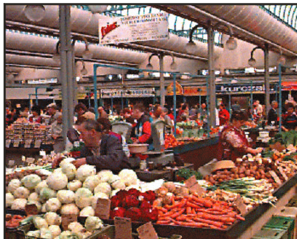
Vegetable market: members praised Poland's commitment to liberal trade but some questioned its level of agricultural support.

Members also sought additional details in a number of areas, including: