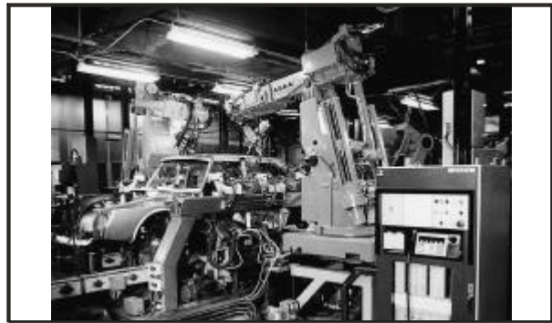
Car manufacturing plant: The EC and Japan urged Canada to implement swiftly DSB recommendations on their “Auto Pact” dispute.

About Canada’s certain measures affecting the automotive industry, Canada reported that it intended to comply quickly with DSB recommendations. Regarding some of the recommendations, the domestic legal process would need a reasonable period of time to be completed. It said it was discussing this matter with the complainants. The EC and Japan said that Canada could comply within 90 days as the measures involved administrative orders. The EC said it would refer the matter to arbitration.