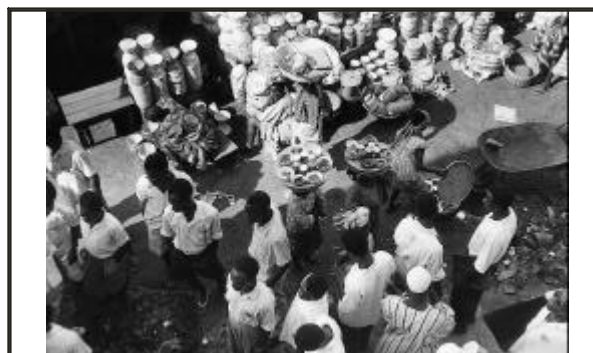
The new IF considers that trade assistance cannot be treated in isolation but in relation to the development priorities of the government concerned.

The Framework itself was "endorsed" in October 1997, at a WTO High Level Meeting (HLM) for LDCs, where it was decided that six agencies - ITC, IMF, UNCTAD, UNDP, World Bank and WTO - would take joint responsibility for the implementation of the framework for delivering trade-related technical assistance to the LDCs. □