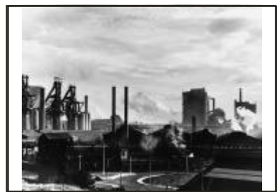
Industrial pollution: A proposal to prevent unnecessary conflicts between the WTO and MEAs.

Several Members, including Australia, New Zealand and the US, felt that the WTO already provides a sufficient framework to facilitate mutual supportiveness with MEAs. Other Members, including Hong Kong China, India, Brazil, Malaysia and Pakistan, said that concerns in this area should not be exaggerated; only ten per cent of MEAs contained trade-related provisions and there had been no legal challenge in the WTO to MEAs. Therefore, there was no need to clarify WTO rules in this regard.