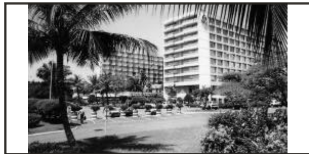
Libreville will host more than 50 trade ministers.

Mr. Mike Moore, Director-General of the WTO, Mr. Salim Ahmed Salim, Secretary-General of the Organiza-