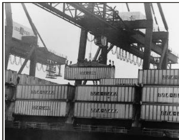
Unloading cargo in Hamburg: developing countries underlined the singular importance of the EU market for their exports.

There was also a wide appreciation of the leading role of the EU in the WTO. The EU was commended on the generally broad scope of its commitments and the attention it gives to its notification obligations. On dispute settlement however the EU was urged to speedily resolve the outstanding implementation problems in the bananas and hormones cases. We also heard divergent views on the EU's multi-faceted approach to trade policy, combining multi-lateral with regional and bi-lateral initiatives. There was in particular interest on the nature of the commitments exchanged on agricultural products and services in the recently concluded agreements with South Africa and Mexico, as well as a number of comments on the Partnership Agreement of Cotonou. It was noted that the EU imports on an MFN basis only from eight WTO Members; may I add that the EU's own exports benefit from MFN treatment in the markets of WTO Members except for the 17 non-EU Members with which free trade or customs unions are in place. There is no better testimony to the EU's