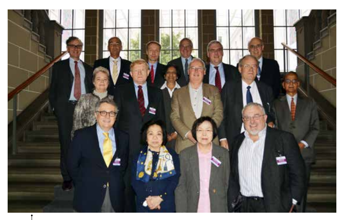
Many of the contributors to this book, attending the Symposium on the TRIPS Agreement in February 2015.