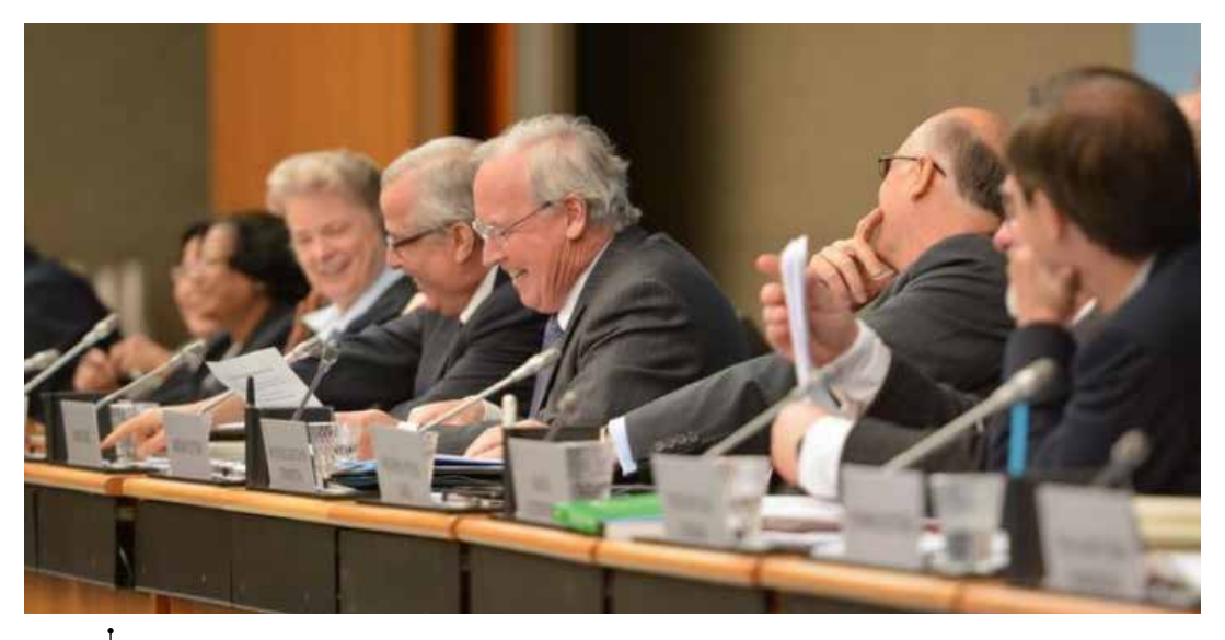
Symposium on the TRIPS Agreement, 26 February 2015, at the WTO headquarters in Geneva, Switzerland.