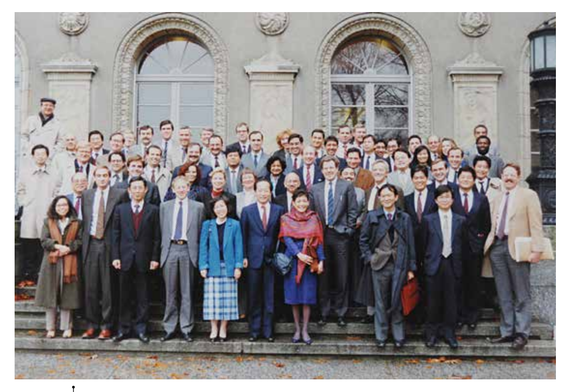
TRIPS negotiators in 1990 at the Centre William Rappard (authors in the volume shown below).