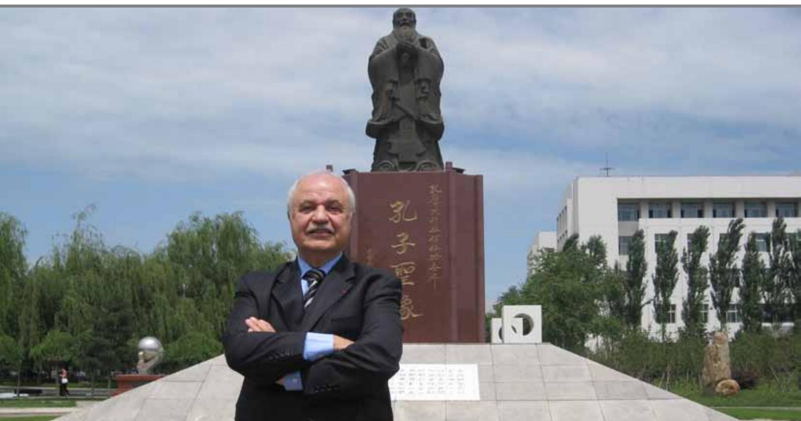
HE Dr. Talal Abu-Ghazaleh standing in front of the Confucius statue during his visit to the People's Republic of China