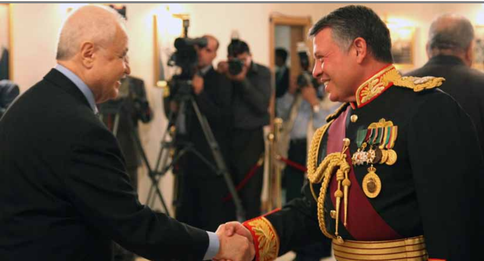
His Majesty King Abdullah II with HE Senator Talal Abu-Ghazaleh during the opening of the 16th Parliament's First Ordinary Session – November 28, 2010.