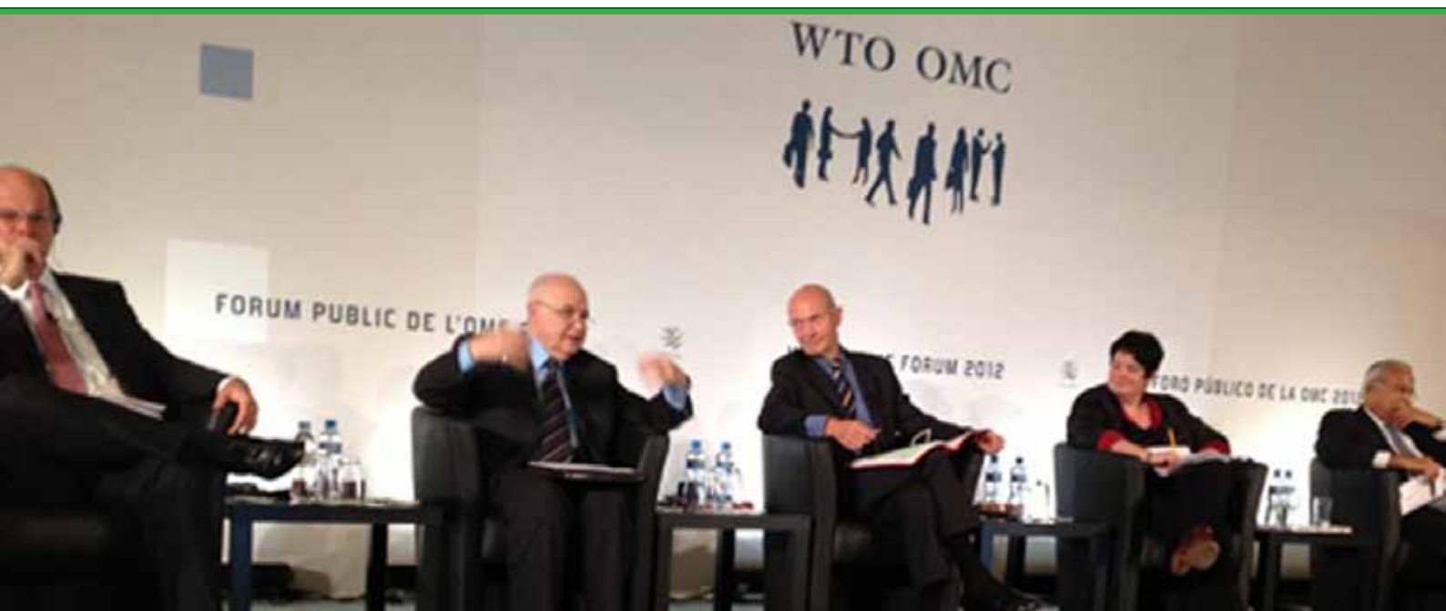
HE Dr. Talal Abu-Ghazaleh speaks during the World Trade Organization (WTO) Public Forum held in Geneva

European Trade Commissioner Seattle WTO Ministerial Conference December 2, 1999