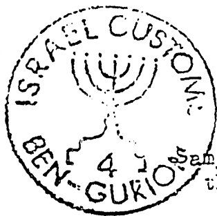
Sample of the stamp of the Export Station