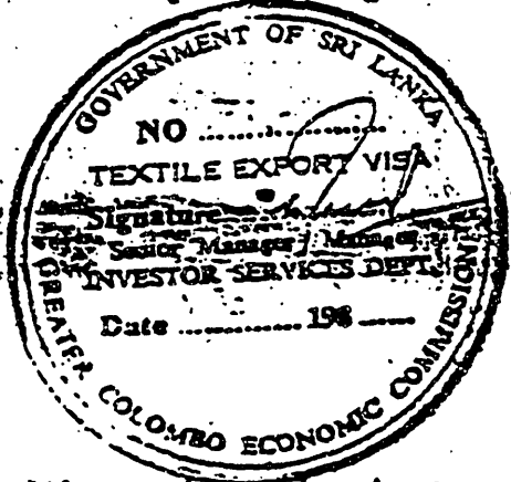
Stamp with specimen signature

P.L.C. Obeyesekere ..... Specimen Signature