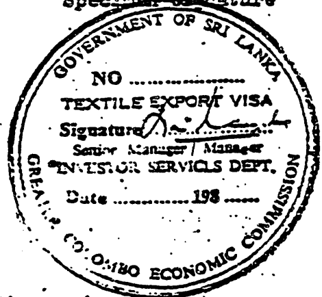
Stamp with specimen signature.