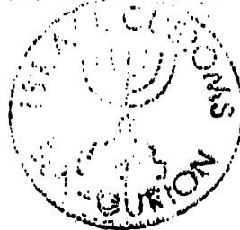
Sample of the stamp of the Export Station

בית המכס נתנין מנח' היצוא CUSTOM HOUSE BEN GURION AIRPORT 13-01-1938 ת יוני : עול הצהרת היצוא 55 : יריקה וחומר ליצוא