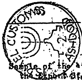
Sample of the stamp of the Export Station