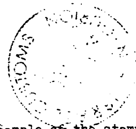
Sample of the stamp of the Export Station