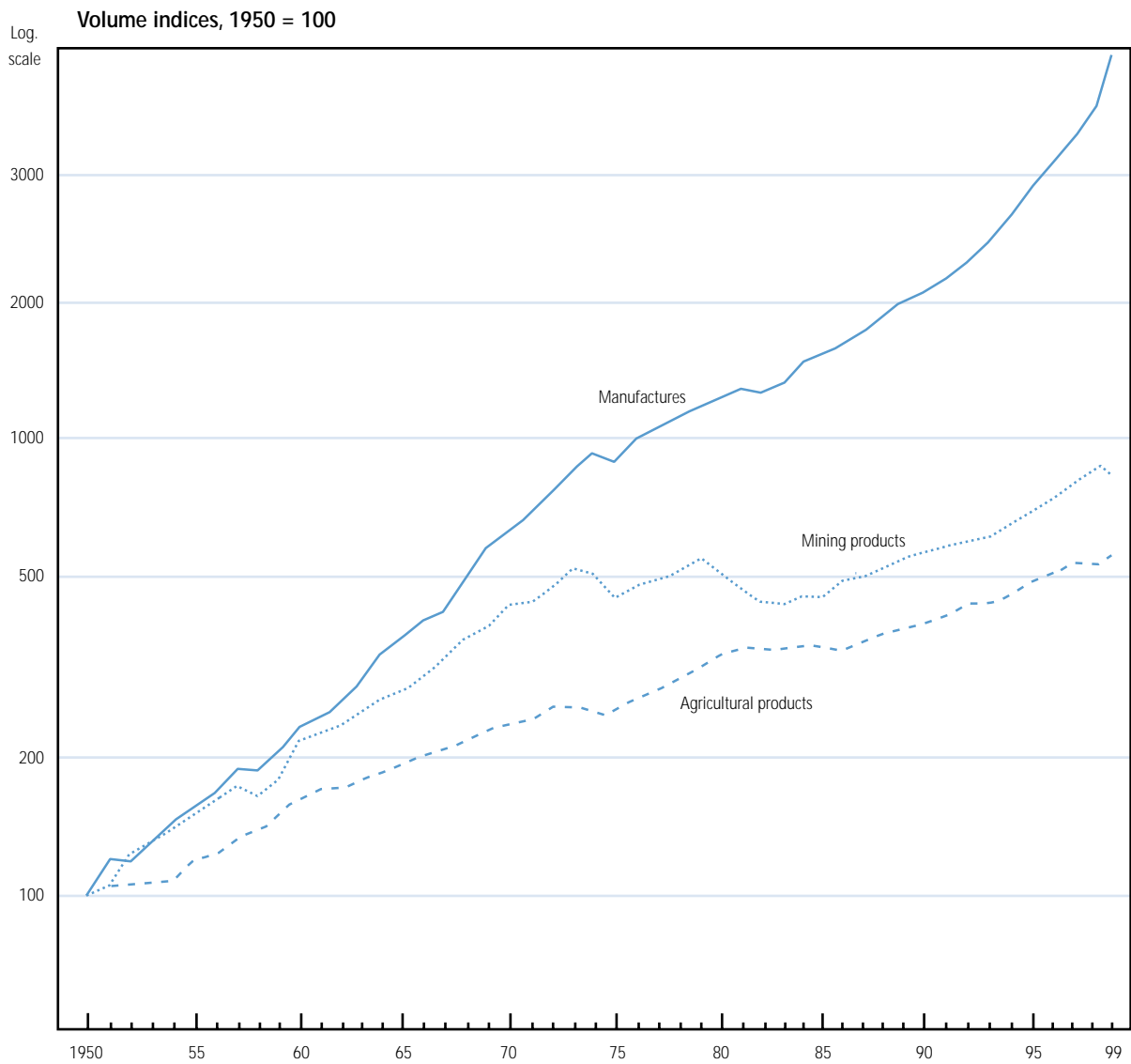
Average Annual Change