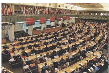
CPM in session

https://www.ippc.int/id/184232?language=en