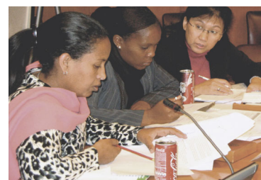
Participants compare notes at a recent FAO biosecurity toolkit training session