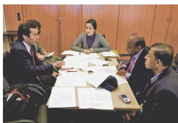
Dr Gaston Funes of the OIE leading a discussion on the PVS

through the IF process have been developed into projects using project preparation grants (PPGs). 19 projects have been developed to date and we plan further activities.