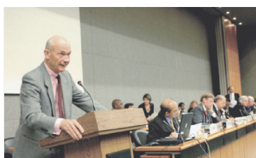
WTO Director-General Pascal Lamy at the Aid for Trade Global Review 20 November 2007

2008-2009 Operating Plan STDF Operational Rules Medium Term Strategy