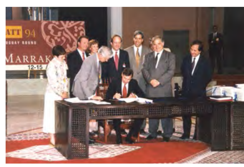
Signing in April 1994 of the Marrakesh Agreement, which formally established the WTO.

Since CITES predates the concepts of sustainable development and use as articulated in global environmental summits and international agreements, there is no express mention in the Convention of sustainable development. Nevertheless, the broad contributions of CITES to achieving sustainable development and use result directly from the text of the Convention and the way it is applied. Its requirements that trade not be detrimental to the survival of the species concerned, and that species be maintained throughout their range at a level consistent with their role in the ecosystem, contribute directly to achieving sustainable consumption and production - one of the key elements of sustainable development. The Convention's requirements that traded specimens be lawfully obtained and that Parties take appropriate measures to enforce the Convention also contribute to these objectives, as do efforts under the Convention to combat illegal trade in wildlife.