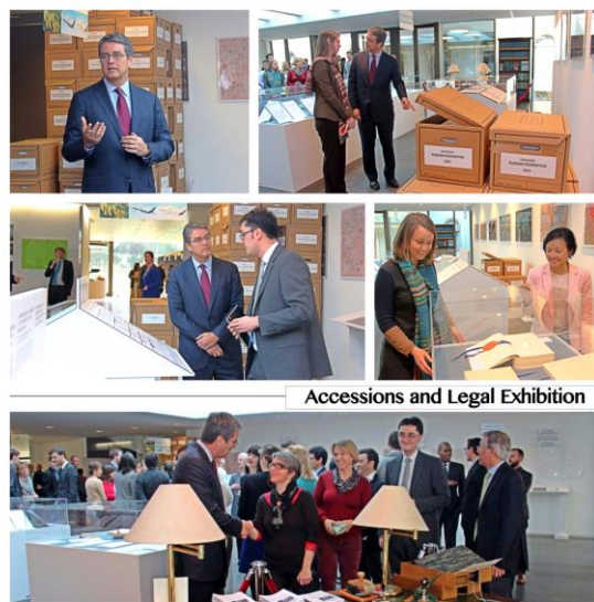
Accessions and Legal Exhibition