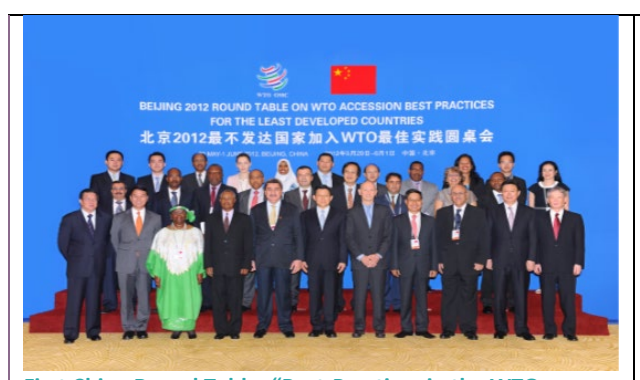
First China Round Table: "Best-Practices in the WTO Accession Process"