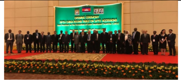
Fifth China Round Table: "Best Practices on the Accessions of Least Developed Countries LDCs"