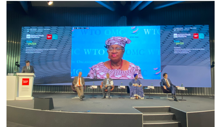
Geneva Trade Week, September 2021