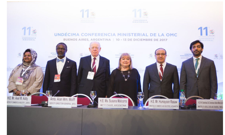
Launch of the g7+ WTO Accessions Group, Buenos Aires, 10 December 2017