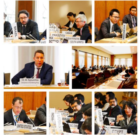
IGA meeting – 28 January 2016