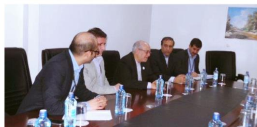
Meeting with the Delegation of Iran, Nairobi, Kenya, 15 December 2015