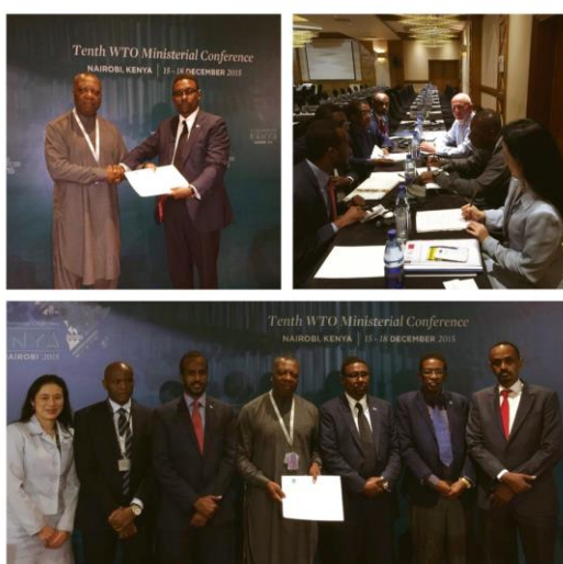
Meeting with the Delegation of Somalia, Nairobi, Kenya, 17 December 2015

Somalia: Somalia had submitted its application to accede to the WTO on the margins of MC10. The application would be circulated to Members once the Secretariat confirms the existence of technical platforms, identifiable and reachable contact points and logistics with Mogadishu that would enable actual negotiations with Somalia. Members would be updated as soon as this information was available.