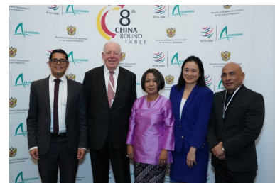
Meeting with Delegation of Timor-Leste at the 8 th China Round Table

As part of the activation of the Working Party, a visit of Ambassador Rui Macieira (Portugal), Chairperson of the Working Party, to Dili is planned during the first quarter 2020 to establish contacts with Minister Magalhães and other officials in the Government.