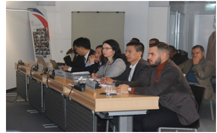
Participants of the Training Course on Goods Schedules for WTO Accession

In addition, former negotiators from four recently acceded Members - Kazakhstan, Lao PDR, Montenegro, and Yemen shared their experiences in the market access negotiations and offered advice to the acceding governments.