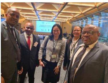
"Conférence des partenaires au développement de l'Union des Comores", Paris, 2 December 2019