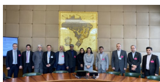
Meeting with Delegation of Iran — 17 December 2019

Iran: On 17 December, a delegation from Tehran, comprising of 9 officials from the Ministry of Industry, Mine and Trade and the Ministry of Foreign Affairs visited the WTO. This visit was part of the participation in the EU-Iran Trade Development Project being implemented with the ITC. The Accessions Division delivered a presentation on WTO accessions and engaged in discussions on various topical issues with the delegation.