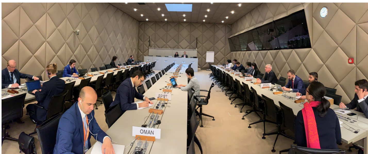
Informal Group on Accessions Meeting — 28 May 2019