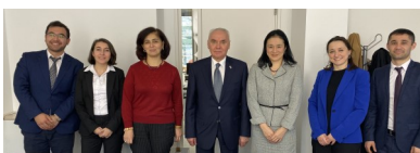
Meeting with Delegation of Azerbaijan — 17 December 2019

Azerbaijan: During the week of 16 December, a delegation from Baku, led by Mr. Mahmud Mammad-Guliyev, Deputy Minister of Foreign Affairs and Chief Negotiator for WTO accession, visited Geneva. The main objective of the visit was to advance bilateral market access negotiations with Members.