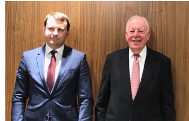
Meeting between DDG Alan Wolff and Minister Maxim Oreshkin (Russian Federation)